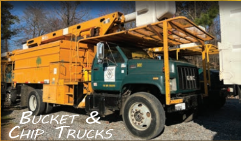
BUCKET & CHIP TRUCKS