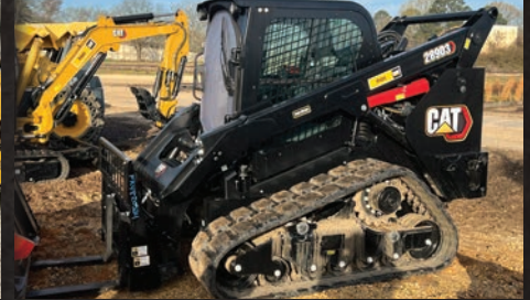
Only 10 hrs - Right off job