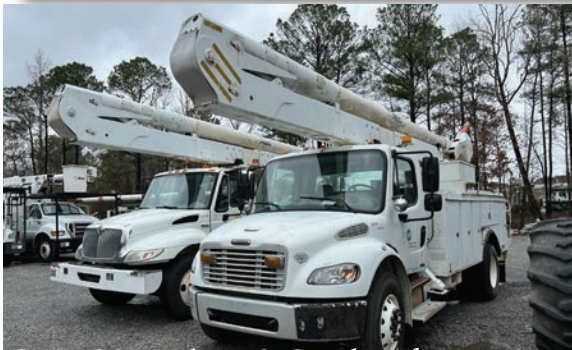
Over 20 Buckets & Combos from Arkansas Electric Cooperatives & More

Watch web site for additions close to auction day 'cause there will be MORE!