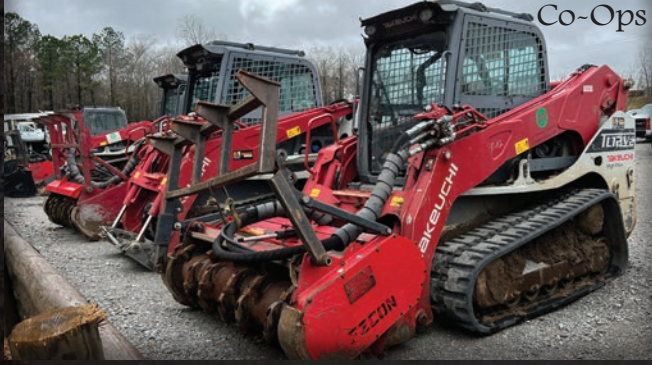
TAKEUCHI MULCHERS - Arkansas Electric Co-Ops