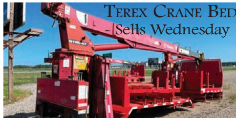
TEREX CRANE BED Sells Wednesday