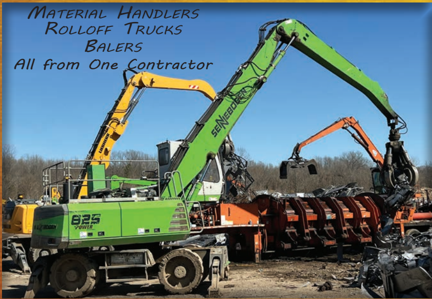
MATERIAL HANDLERS ROLLOFF TRUCKS BALERS All from One Contractor

• AUCTION • APRIL 12-14 • LITTLE ROCK, ARKANSAS