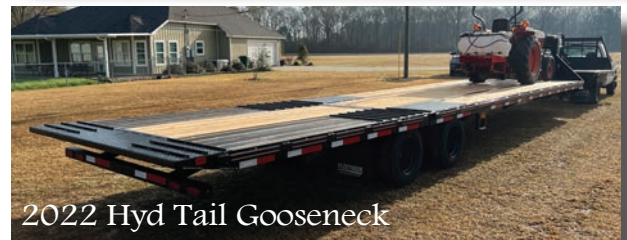
2022 Hyd Tail Gooseneck