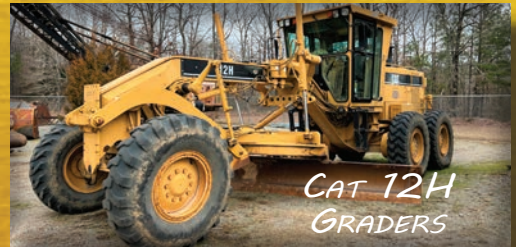
CAT 12H GRADERS