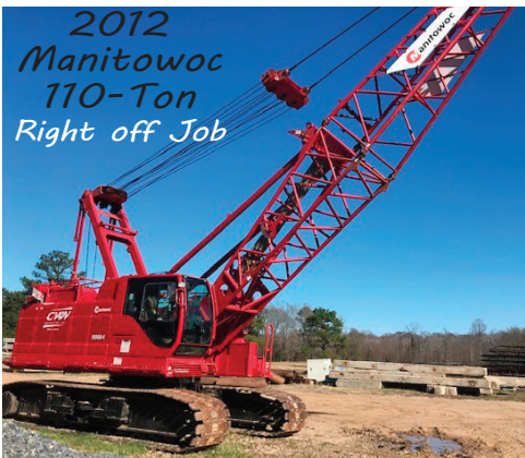
2012 Manitowoc 110-Ton Right off Job

County Equipment More! Send your items too!