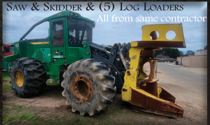
SAW & SKIDDER & (5) LOG LOADERS - All from same contractor

425 BLACKMON ROAD, LONOKE, ARKANSAS 72086