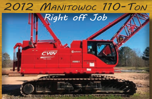
2012 MANITOWOC 110-TON Right off Job