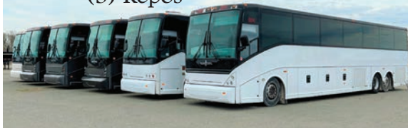
'08-'05 VANHOOL 56 PASS COACH ~ (5) Repos

List of Items & Photos at www.BlackmonAuctions.com