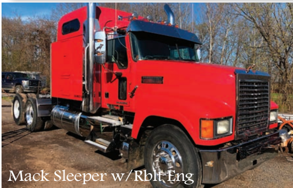
Mack Sleeper w/Rblt Eng