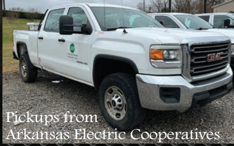
Pickups from Arkansas Electric Cooperatives