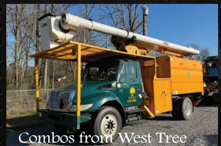
Combos from West Tree