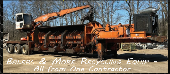
BALERS & MORE RECYCLING EQUIP - All from One Contractor

• THURSDAY, APRIL 14 - EQUIPMENT DAY - 8AM •