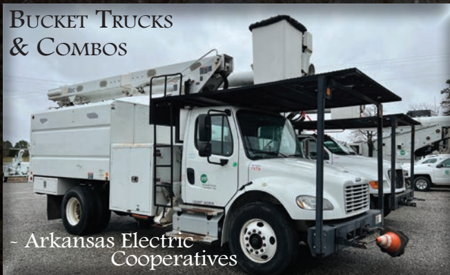
- Arkansas Electric Cooperatives