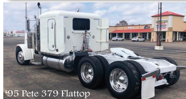
'95 Pete 379 Flattop

Many More Trucks & Trailers by Auction Day! www.BlackmonAuctions.com