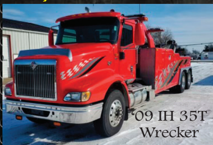
'09 IH 35T Wrecker

Many More Trucks & Trailers by Auction Day! www.BlackmonAuctions.com