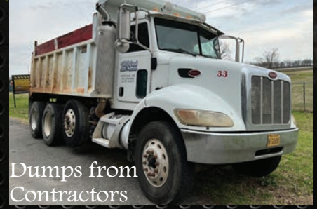
Dumps from Contractors

• WEDNESDAY, APRIL 13 - TRUCK & TRAILER DAY - 8AM •