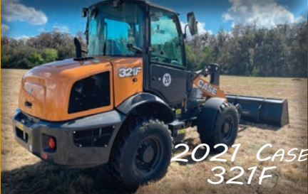
2021 CASE 321F

PRESORTED FIRST CLASS US POSTAGE PAID LITTLE ROCK, AR PERMIT #1705