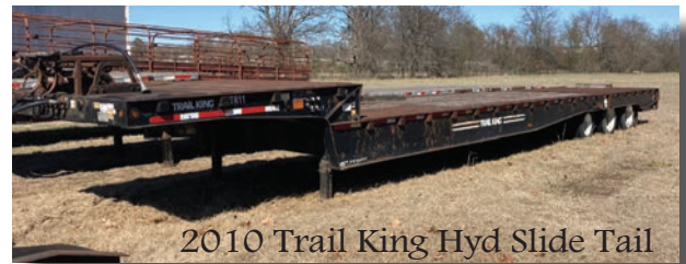
2010 Trail King Hyd Slide Tail