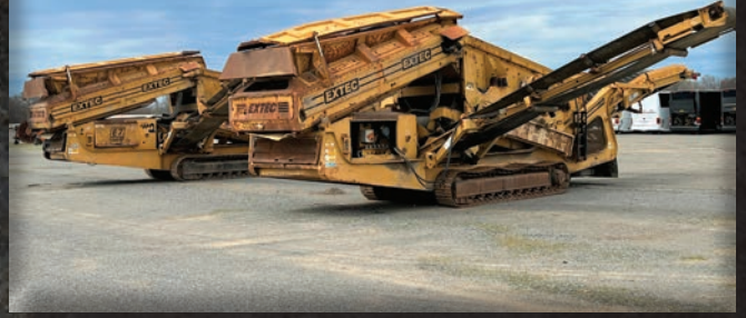
(2) EXTEC E7 CRAWLER SCREENS - Right off Contractors Yard Working