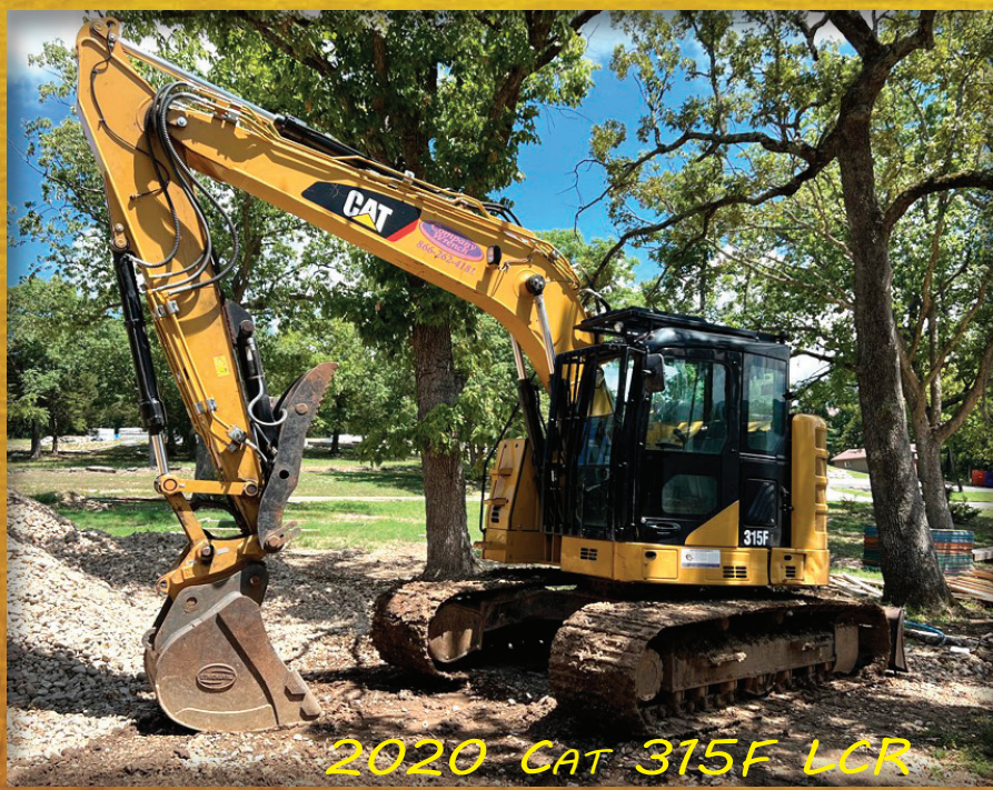
2020 CAT 315F LCR