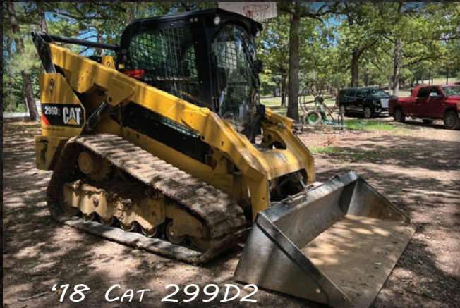
'18 CAT 299D2

• WEDNESDAY, SEPTEMBER 7 | 8AM EARLY START •