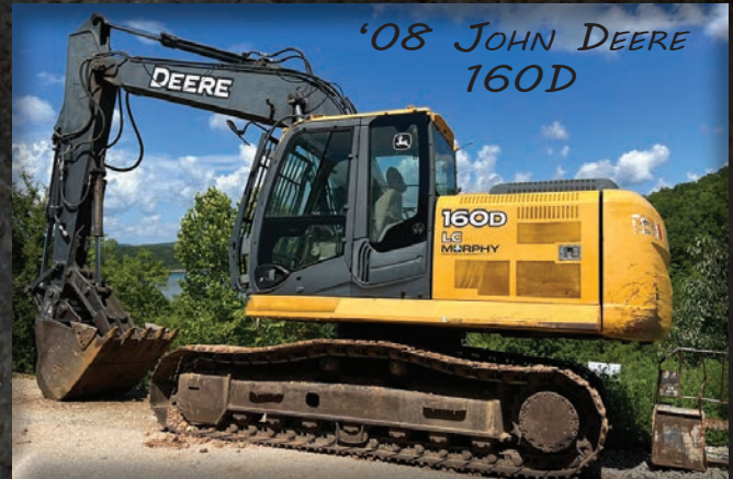
'08 JOHN DEERE 160D

• 13253 MO~13, KIMBERLING CITY, MISSOURI 65686 • Live On-Site Auction & Online Bidding!