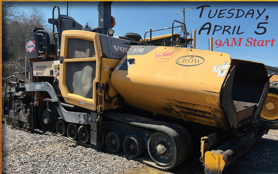
2013 Volvo P7110 Paver